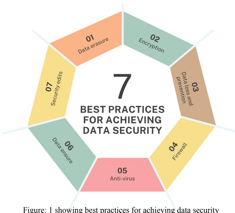
Figure: 1 showing best practices for achieving data security